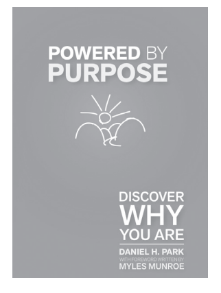
Powered by Purpose: Discover Why You Are (2013)

You can order on danielhpark.com , where you can also find many audio teaching material.