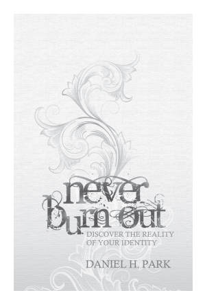
Never Burn Out: Discover the Reality of Your Identity (2011)